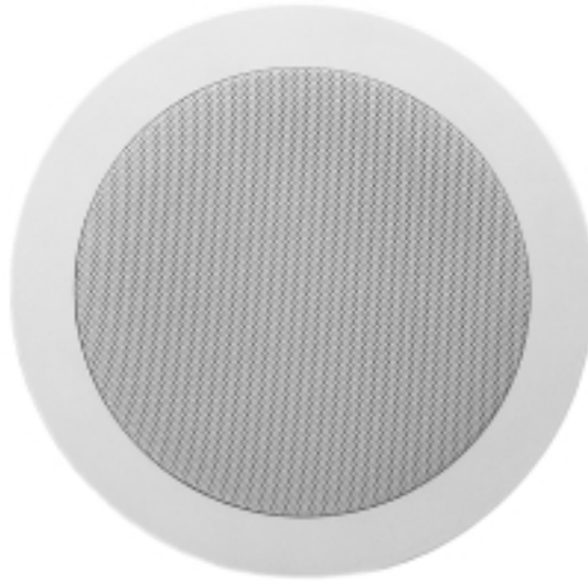
KAS0510WE : 10 WATTS - 5.25"

The KAS05 series are plastic ceiling loudspeakers that has been designed for applications where stylish design together with high sound quality are required. These loudspeakers are perfect for value-conscious indoors audio project requirements. It's very effective for voice transmission, music and signal reproduction in commercial, industrial, and institutional applications. Applications include ceiling installation in offices, banks, schools, restaurants, hotel/motels, and wherever precise transmission of audio is required.