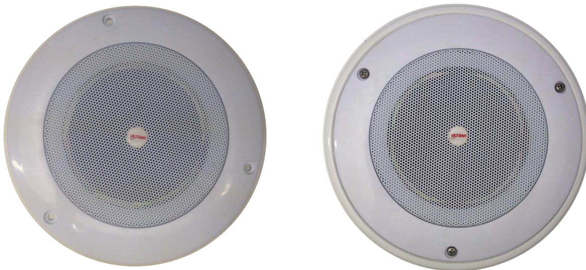
KAS0520WE/W: 20 WATTS / 5.25"

ROUND PLASTIC CEILING / WALL LOUDSPEAKER