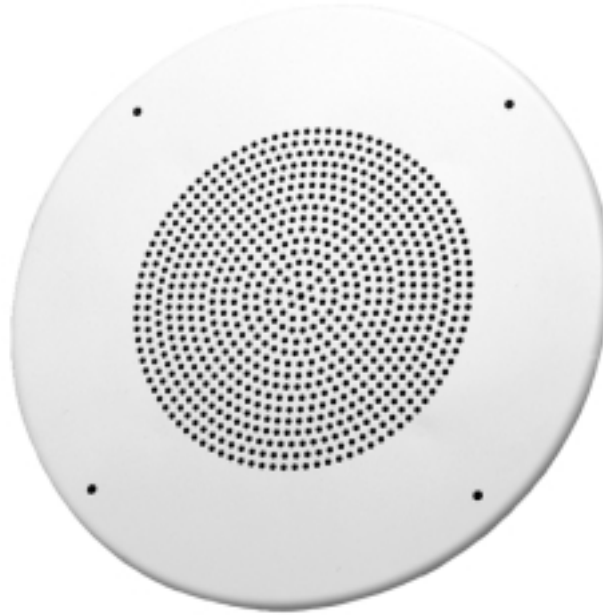
KAS0810W: 10 WATTS / 8"

The KAS0810W is a twin-cone, 8", 10-watt full-range speaker package shipped with an attached grill and premounted 70.7/25-volt transformer.