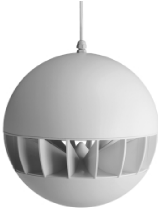
KAS7520W: 20 WATTS / 8" DUAL CONE

This modern-styled spherical loudspeaker gives an even dispersion over the audio spectrum. This excellent dispersion together with smooth frequency response and carefully controlled performance enable these speakers to offer solutions to many problems that arise in difficult acoustic applications.